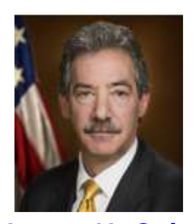
James M. Cole Deputy Attorney General U.S. Department of Justice